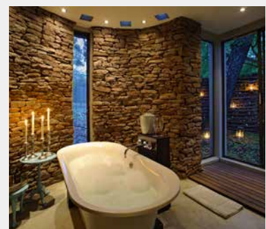
TABLE OF FACTS